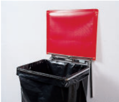
Wall version bag holder. Is fixed to the wall.