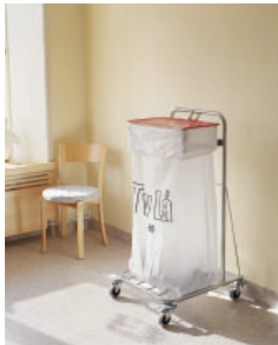
Laundry-bag holder for 125-litre bags. All-welded chromium-plated tubular steel stand. Hooks for wire basket. The spring steel bag holder keeps the bag firmly in place. Four 75-mm castors with 80-mm guard ring.