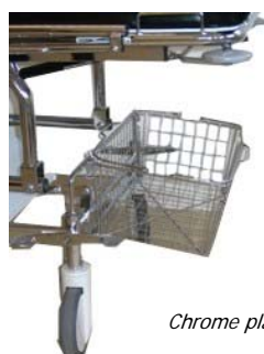
Chrome plated basket