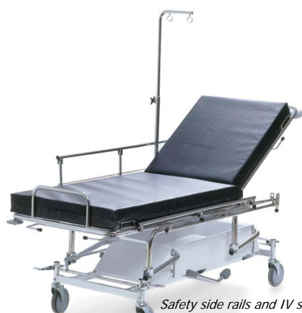
Safety side rails and IV stand.

Central locking easy roll 150mm castors, one with direction locking to facilitate easy transfer.