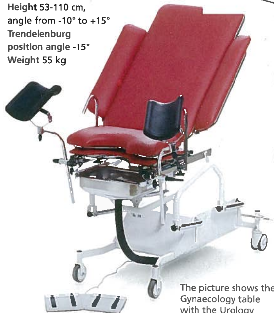
The picture shows the Gynaecology table with the Urology attachment, 010-2065