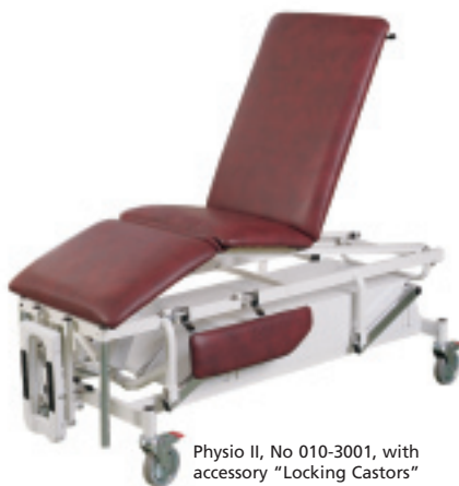
Physio II, No 010-3001, with accessory "Locking Castors"