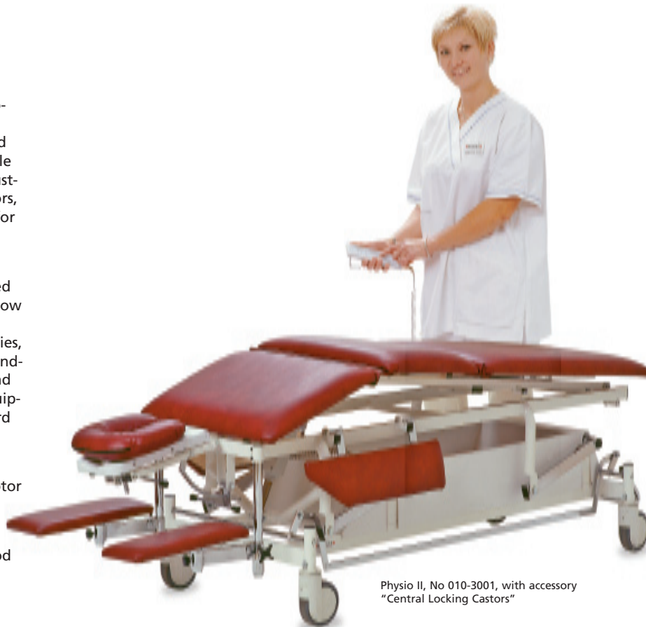
Physio II, No 010-3001, with accessory "Central Locking Castors"

Full length: 195 cm Leg section: 80 cm Middle section: 38 cm Front section: 42 cm Headrest: 35 cm