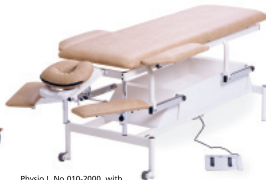
Physio I, No 010-2000, with two front castors (standard)